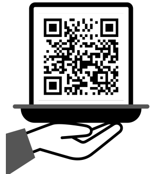
Virtual Offering Plate

Today is FISH Sunday, please leave an extra offering in the FISH envelopes in the pew (or online under FISH) to support our FISH food pantry ministry (and see their July report on the last page of the bulletin)!