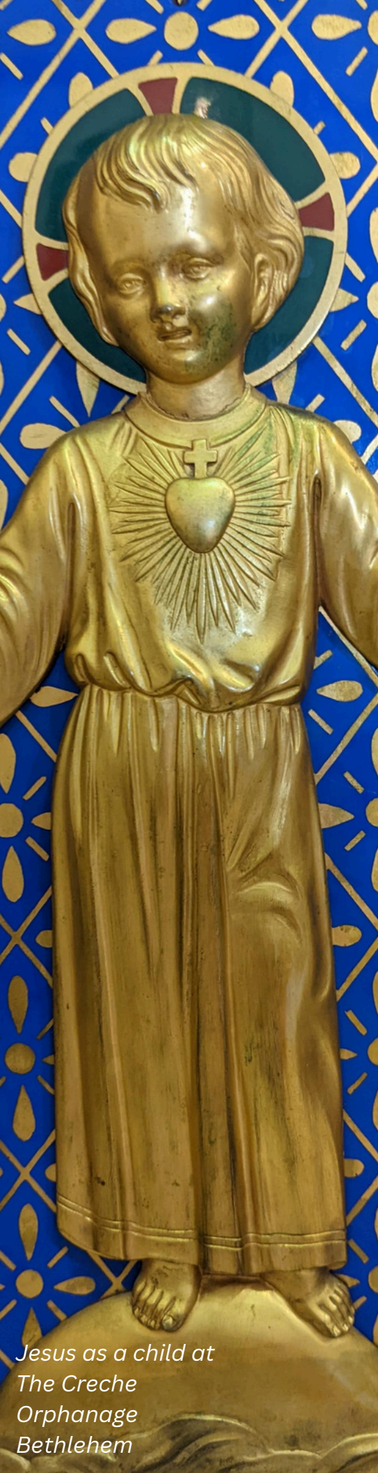
Jesus as a child at The Creche Orphanage Bethlehem

Righteousness shall be the belt around his waist, and faithfulness the belt around his loins.